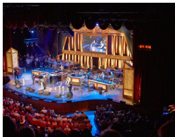
Live music & tour at Grand Ole Opry