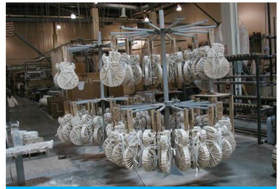
Tour Gibson's Memphis guitar factory