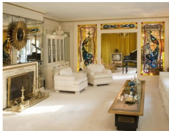
Tour Elvis' Graceland