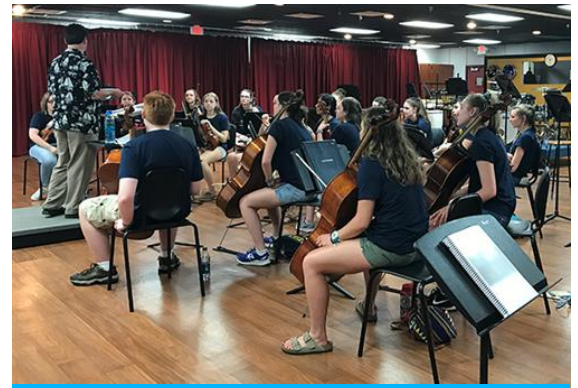
Music workshop & performance at Vanderbilt University