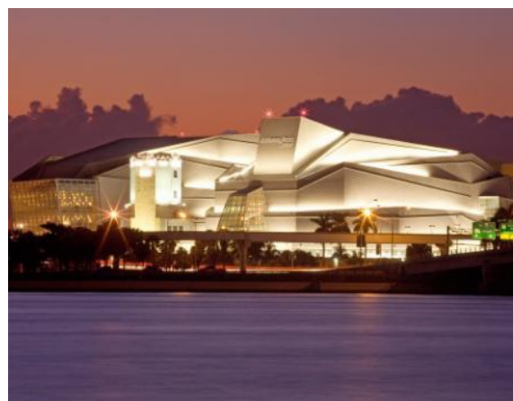
Tour and perform at the Adrienne Arsht Center for the Performing Arts