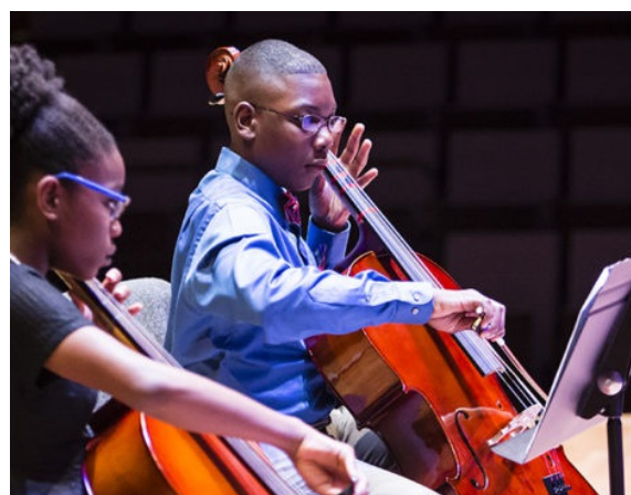
Musical workshop at the University of Miami Frost School of Music