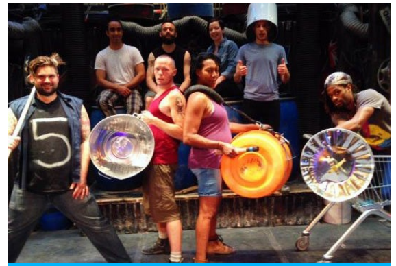
Enjoy a live performance of Stomp