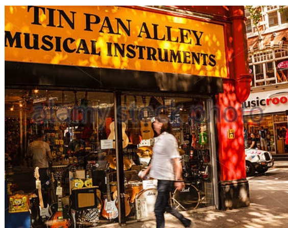
Explore Tin Alley's musical history and shops