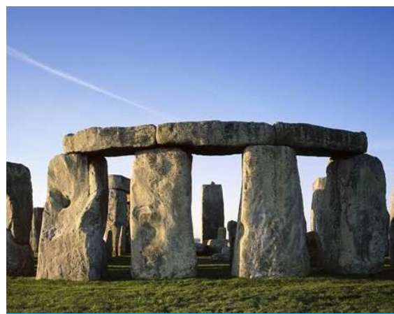
Day trip to Stonehenge